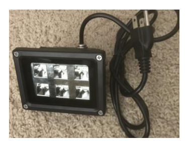
12w 365nm UV LED Outdoor Black Light

Your web is made from special 5mm (about 3/16") nylon rope that glows under a UV light (black light). Outdoors I recommend using one 12w 365nm UV LED outdoor black light which is available for $34.95 at <a href="https://www.spiderwebman.net">www.spiderwebman.net</a>. It does not produce purple light like most UV LED lights. It is near the top of the "Purchase" page.